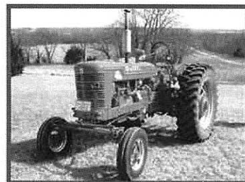
1954 Super MTA #812065

Johnson County Fairgrounds Gardner, Kansas