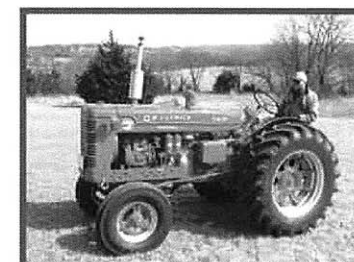
1953 Super WD-6 #6396J

Commission Rates: 8% on all IH tractors, Trucks & items displayed outside.