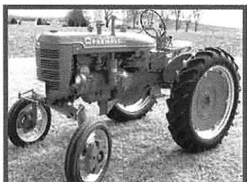
1953 Super AV#SAAV340