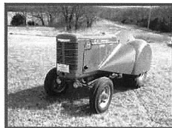
1946 McCormick O6