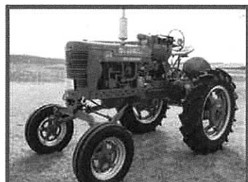
1948 MV # FBKV 171218